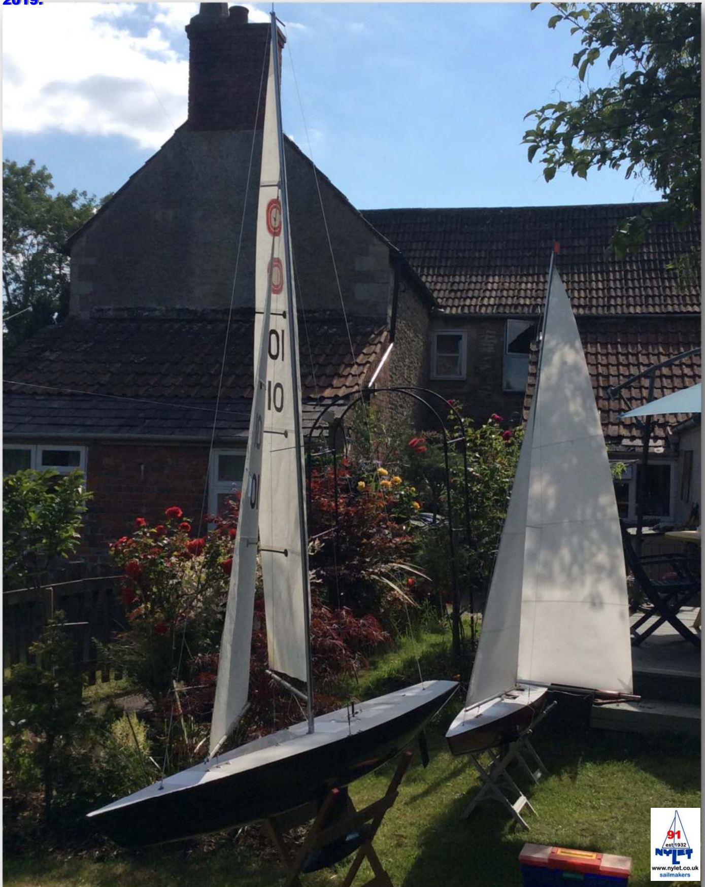
Photo: two yachts, on the left a very fine and majestic Kensington, and the other yacht a Ten Rater "Synergy" with white Dacron Nylet sails. July 2019.